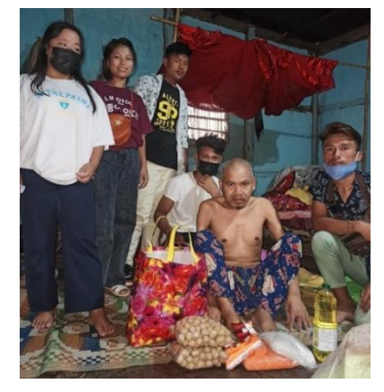
Staff & students buying rice, lentils, soya beans, oil, sugar, salt, tea and separating them to give out. They divided into two teams and gave food packs to 10 families around their area. They had opportunity to share with and pray for some people as well. Some families have requested for them to visit again.